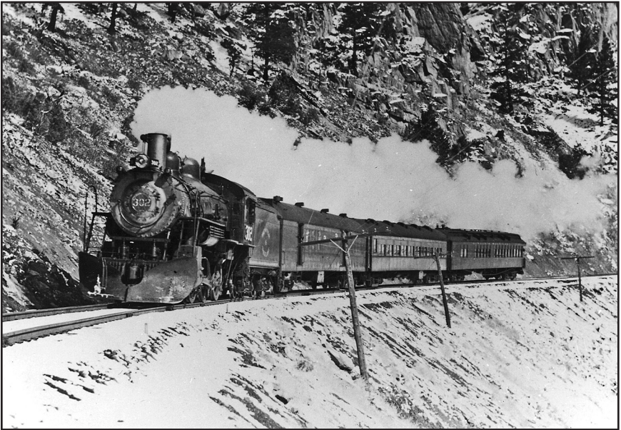
D&SL engine #302 on train #1 with three cars is nearing the west end of Byers Canyon on its way to the end of the track at Craig, Colorado, on February 20, 1938.