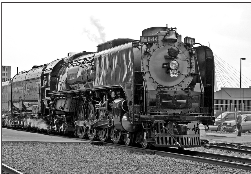
UP Steam Locomotive #844 is positioned in the Denver yards after a July 2006, trip from Cheyenne. The train is being prepared for the Denver Post Cheyenne Frontier Days Train.