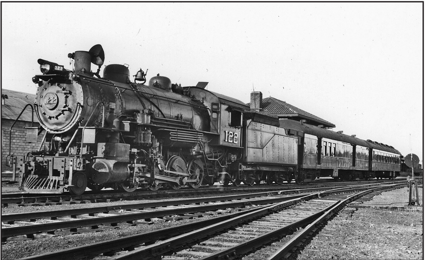
D&SL engine #122 was the power for train #1 on its daily run between Denver and Craig, Colorado. In July 1947, photographer Bert Ward captured the train in the afternoon at the depot in Craig.