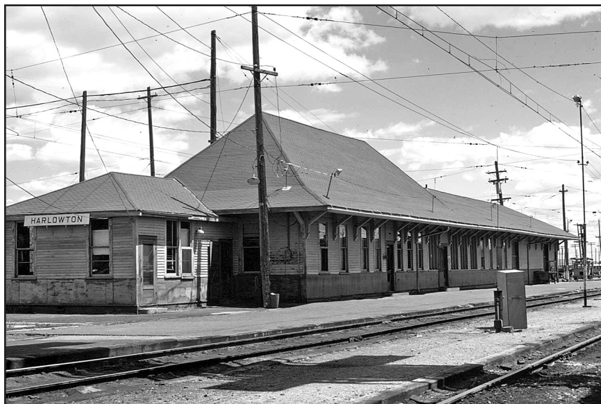
Harlowton Station on June 9, 1974.

Due to the UP steam trip, there will not be a monthly meeting in July.