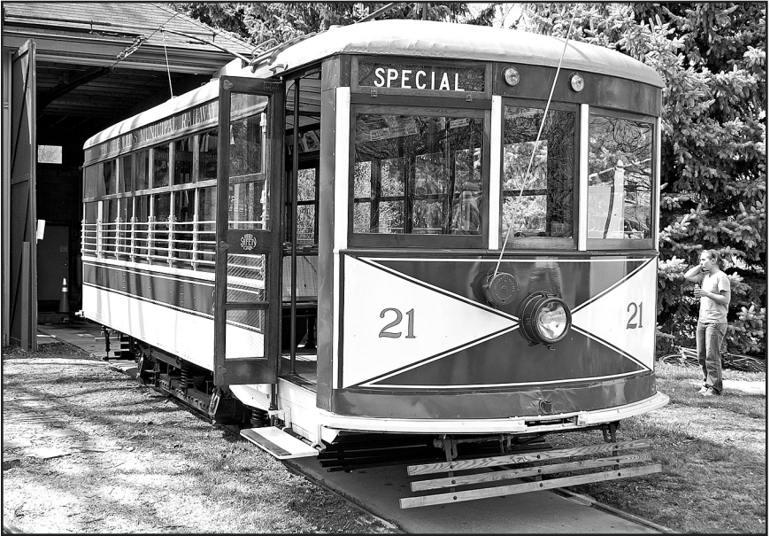
The Fort Collins Municipal Railway begins their 26th season on May 1st in northern Colorado.