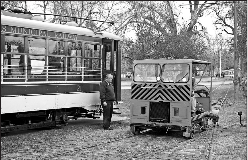
The Fort Collins Municipal Railway maintenance motor car has a special attachment to keep the flangeways clear for the trolley line, shown here on April 16, 2011. – Photo © 2011 Dave Schaaf.