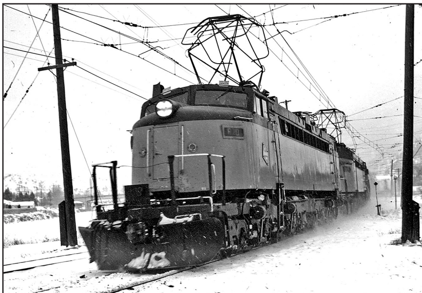
A Milwaukee Road E70 at Missoula, Montana.